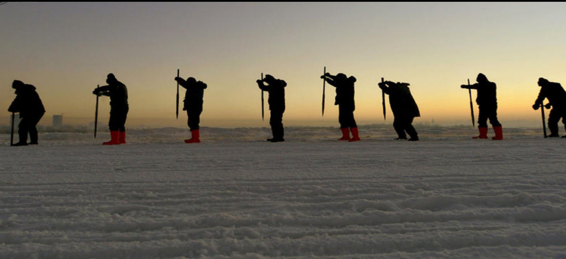
In Harbin, in Northern China in January