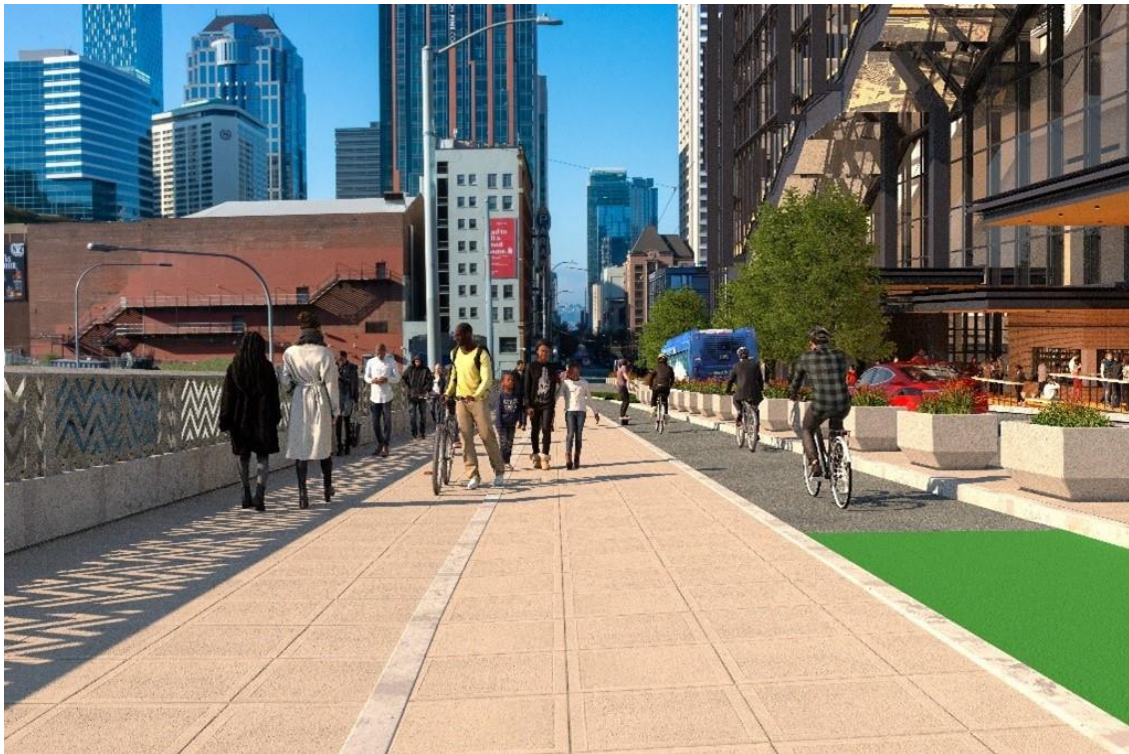
Rendering of proposed improvements to one of the project areas (the bridge on Pine

The Pike Pine Streetscape and Bicycle Improvements Project will complete design in early 2022 and be ready for construction by mid-to-late 2022.