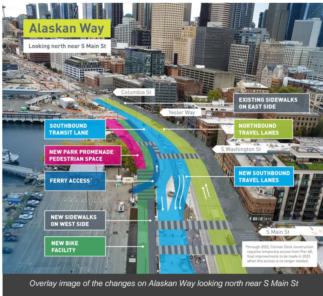
Overlay image of the changes on Alaskan Way looking north near S Main St

Construction of the new Alaskan Way is reaching another milestone. Starting on Friday, November 12 (weather permitting), we will reduce Alaskan Way to one lane in each direction between S King and S Main streets to move southbound traffic onto new concrete lanes. The traffic shift will be completed by November 15 and includes opening a new southbound transit lane, new sidewalks and part of the new bike path on the west side of Alaskan Way. We will be working around the clock to transition traffic to this new configuration safely and efficiently.